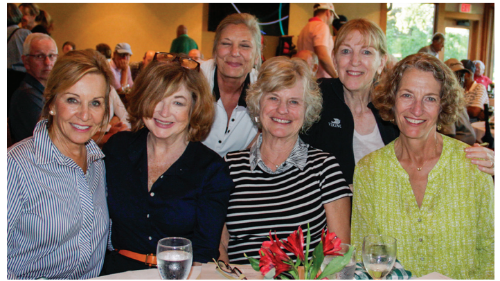
Participants (above, left and right) enjoy the WCSF post-golf festivities at the Wilmette Golf Course.